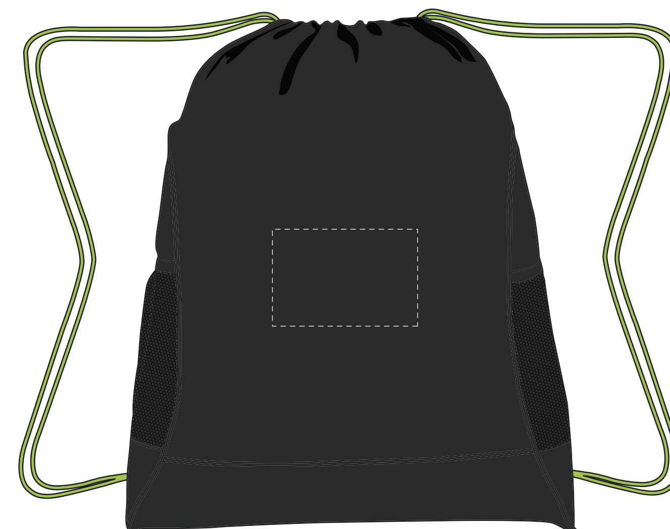
COMPOSITE NOT ACTUAL SIZE

Dashed Line For Imprint Area Only. Will Not Print.