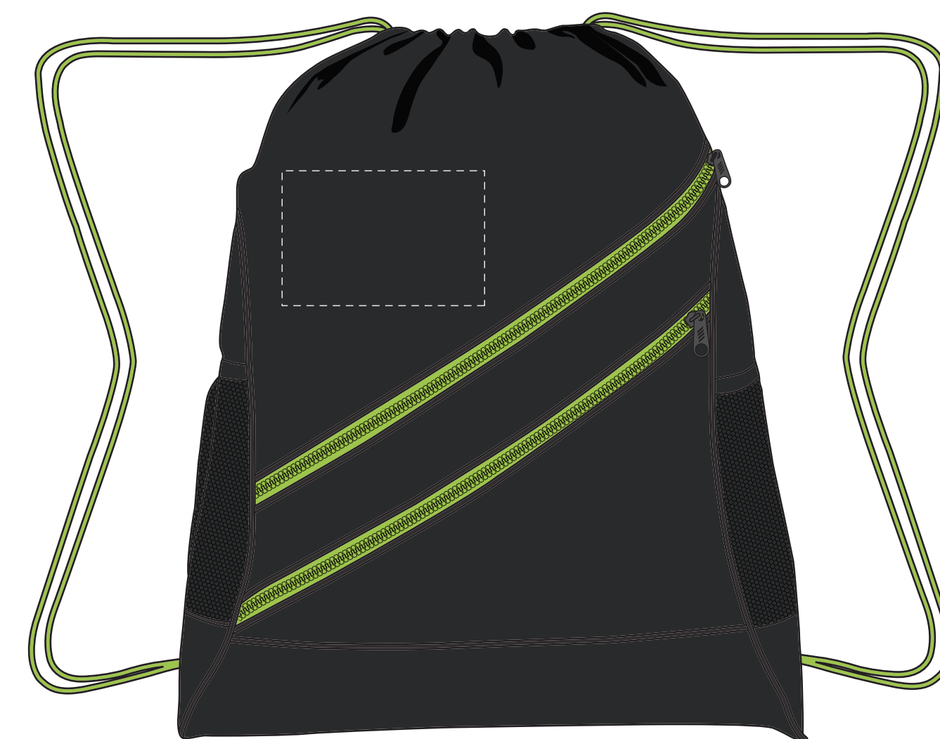
COMPOSITE NOT ACTUAL SIZE

Dashed Line For Imprint Area Only. Will Not Print.